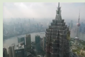
Air Pollution (Smog) in Shanghai

China will modify education for all citizens to promote low-carbon way of life. Public institutes will lead in this initiative by building renovations, increasing in this way sustainability.